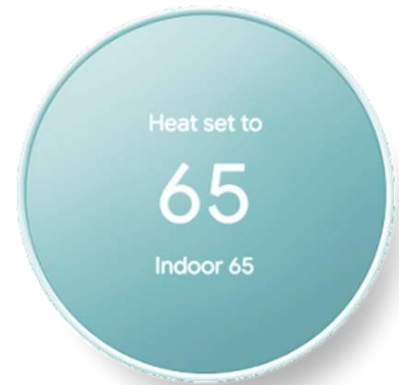
Nest WiFi Thermostat