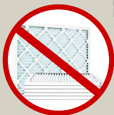
1" MERV 1 filter